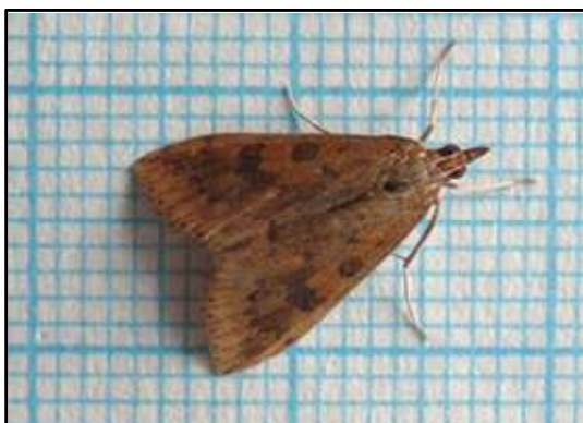
Rusty-dot Pearl by Maurice Aungier (grid 1 mm.)