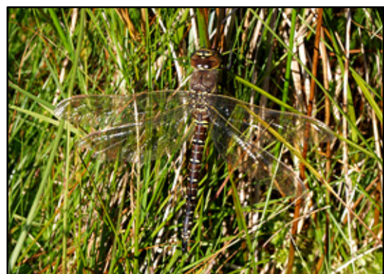
Common Hawker from Skye