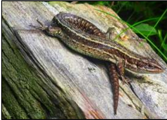
Common Lizard