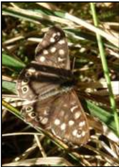
Speckled Wood

Lepidoptera. With the sunny conditions, good numbers of 'whites' have been seen. It's been a good spring so far for Orange Tip records, although Peacock numbers are down a little and Small Tortoiseshell are now scarce. It's good to report another increase in Wall sightings this spring. They have now spread into new tetrads on the coast north of Berwick. Mid-month, 5 Speckled Woods were sighted in Kyloe, an exciting find as these are the most northerly record so far in Northumberland.