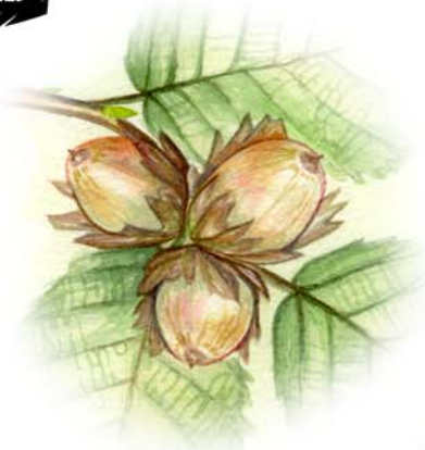
Hazel full (above) squirreled (below)